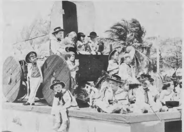
Cowboy and Indians